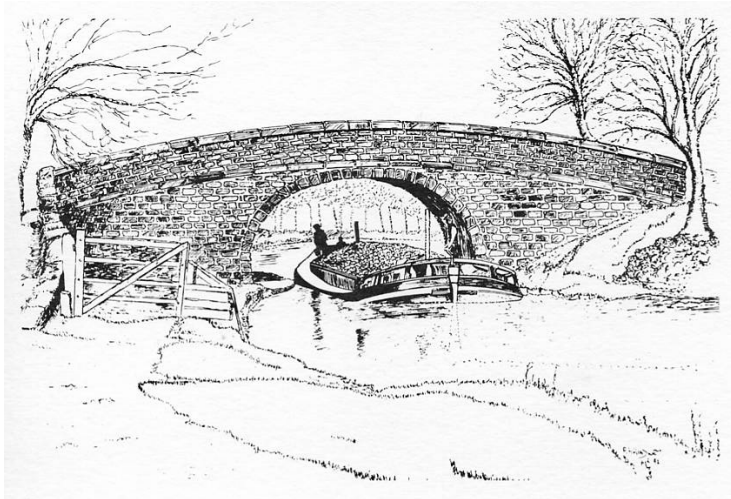
WALTON HALL BRIDGE

South Yorkshire Key Fund—Global Grants Funds Yorkshire—Pioneer Areas Team Yorkshire Rural Community Council Calder Navigation Society IWA—West Riding branch IWA—Restoration Committee Barnsley MBC—Planning and Transport Service Barnsley MBC—Technical Aid for the Community Wakefield MDC Barnsley, Dearne and Dove Canals Trust Royston & Carlton Community Partnership Town Centre Community Partnership